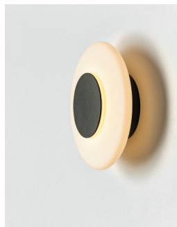
THA_4080 (Indoor version) Page 4