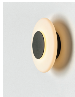
THA_4080B (Bathroom version) Page 5